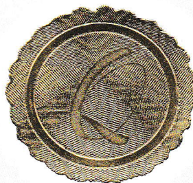
Chairperson: NQA Council